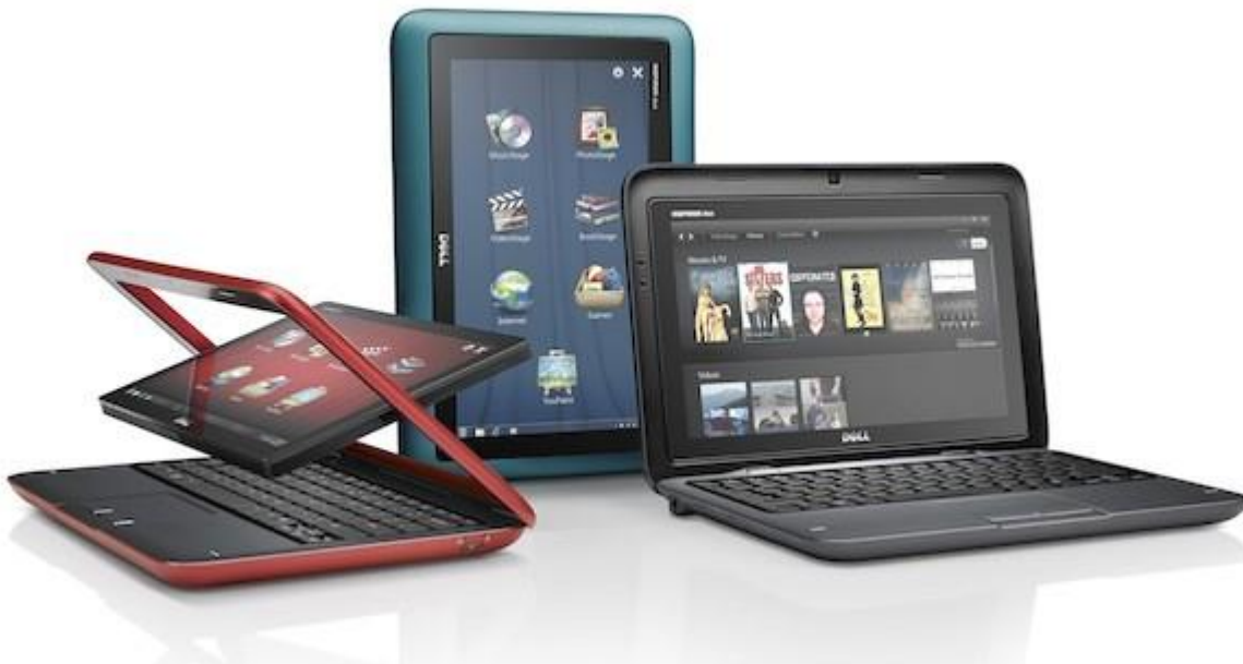
This is the Dell Duo—A Tablet, Netbook, Laptop all in one.