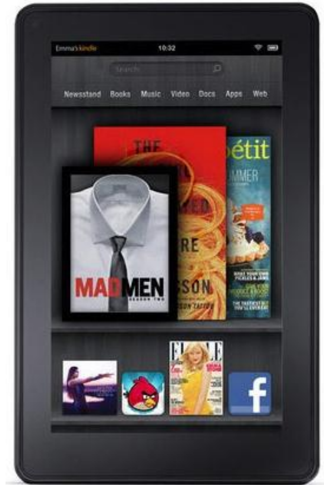
This is the all new Kindle Fire Tablet

Let us keep reading a bit and find out why those questions determined the type of device we should look at for our next purchase.